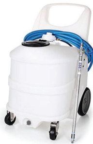
Portable Gel-Spraying Unit (30-gal)