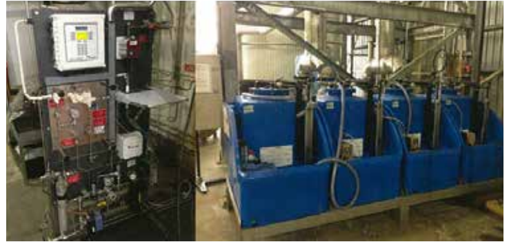
Figure 3 - Installed 3D TRASAR unit at the plant site

event of any excursions. This has been successfully implemented when there have been alarms due to plant shut downs or any other issues. Operators now understand and have an insight into their steam generating operations that they did not have previously. This has allowed for faster and more accurate actions to be taken to address out of control situations.